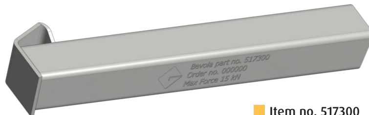
■ Item no. 517300