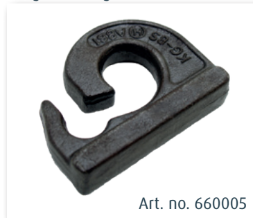
Lashing hook for welding on chassis 6000 kg. 87x11 mm. Weight: 0,35 kg.