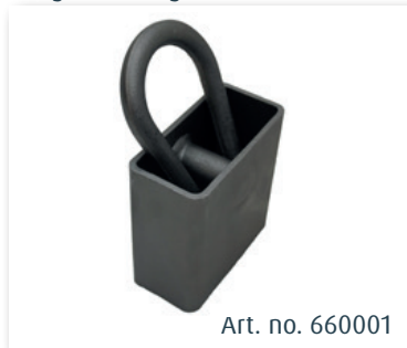
Lashing ring 10.000 kg. 120x60x120 mm. Weight: 2,23 kg.