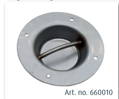
Lashing eye 800 kg. \varnothing 120 (udv.) x 22 mm. Weight: 0,25 kg.