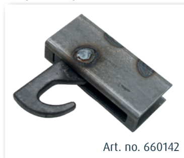
Lashing hook, fold-down 8000 kg. 150x65x37 mm. Weight: 1,8 kg.