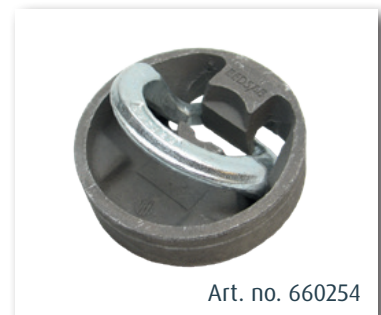
Recessed lashing ring Alloy recessed, steel ring. 2000 kg. \varnothing 92x24 mm. Weight: 0,35 kg.