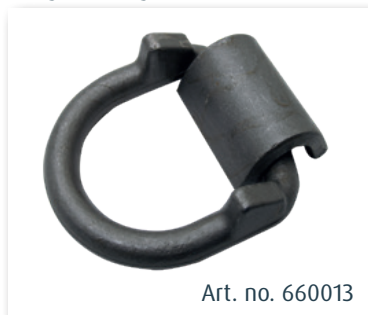
Anchor point 15.000 kg. 132,5x130 mm. Ring \varnothing 23/21 mm. Weight: 1,9 kg.